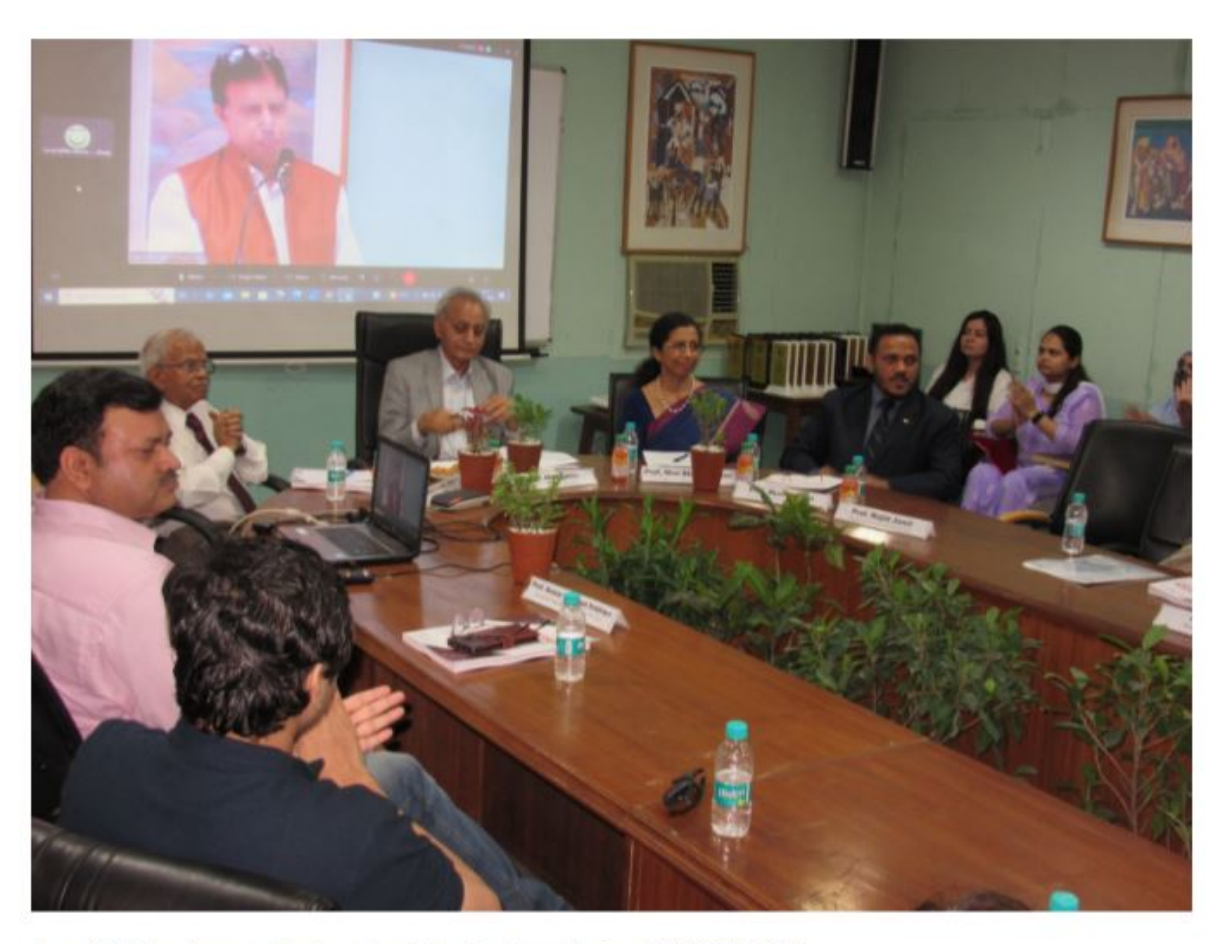
Figure 2 Address by organizing Secretary in the Valedictory Session of REEDCON 2023