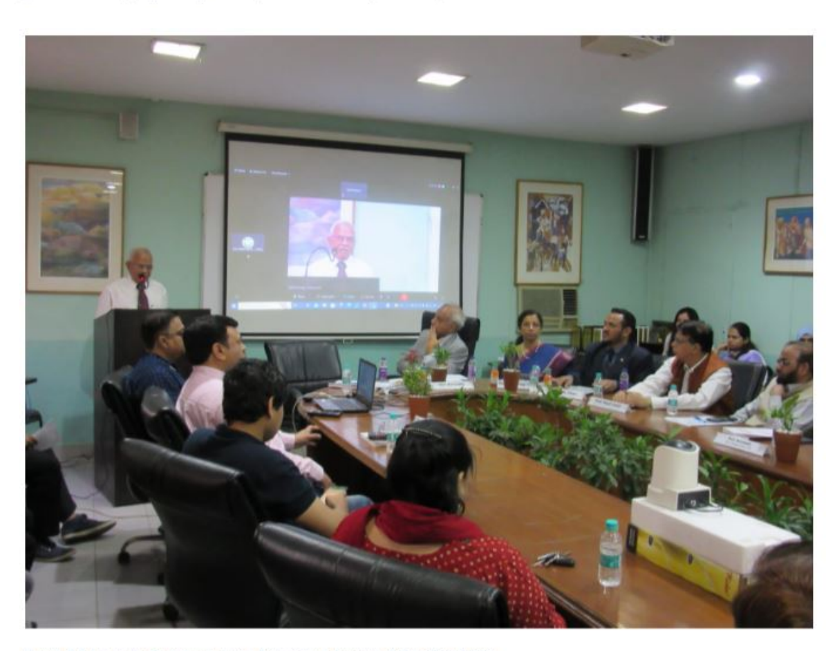
Figure 3 Address by Chef Guest in the Valedictory Session of REEDCON 2023