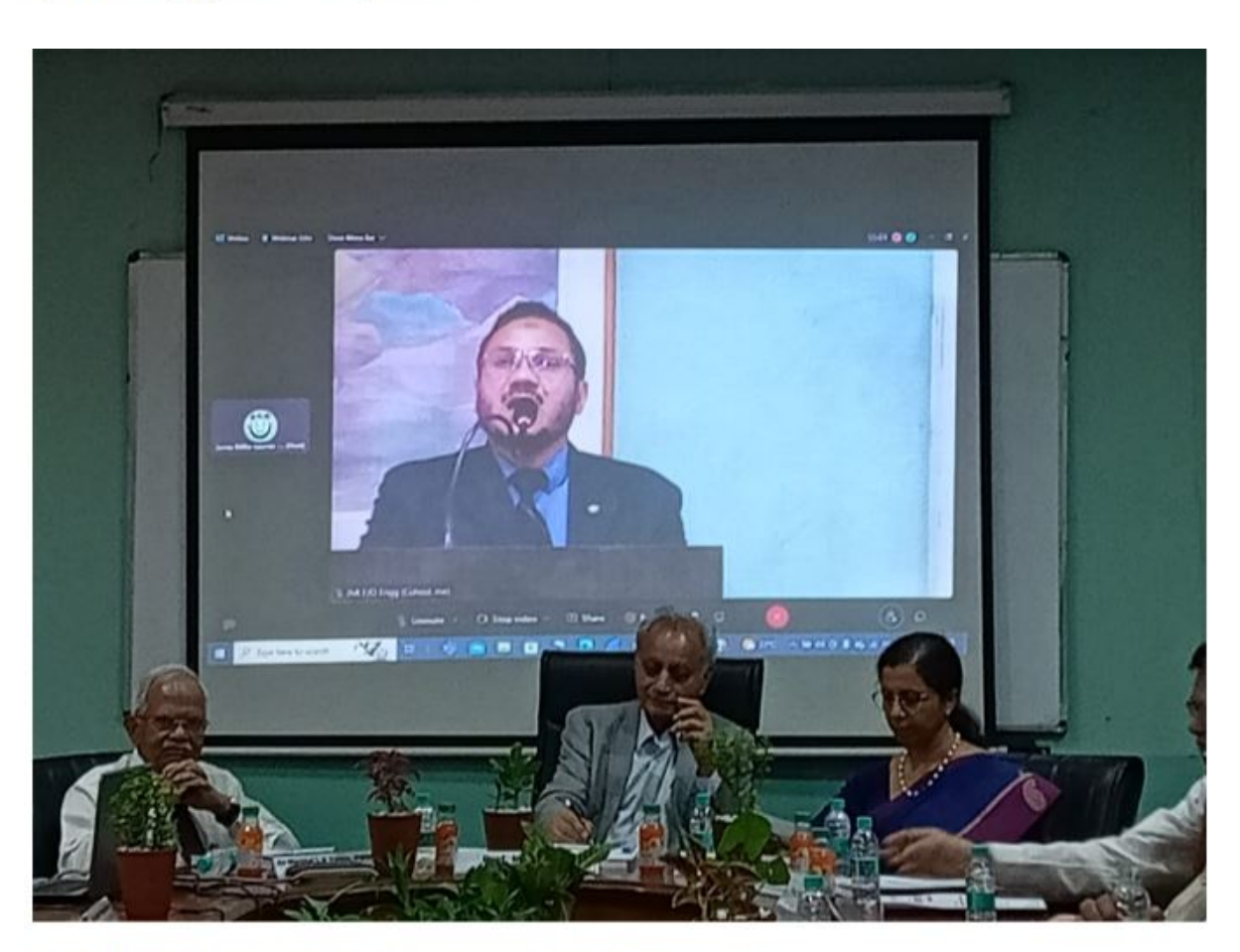
Figure 1 Address by organizing Chair in the Valedictory Session of REEDCON 2023