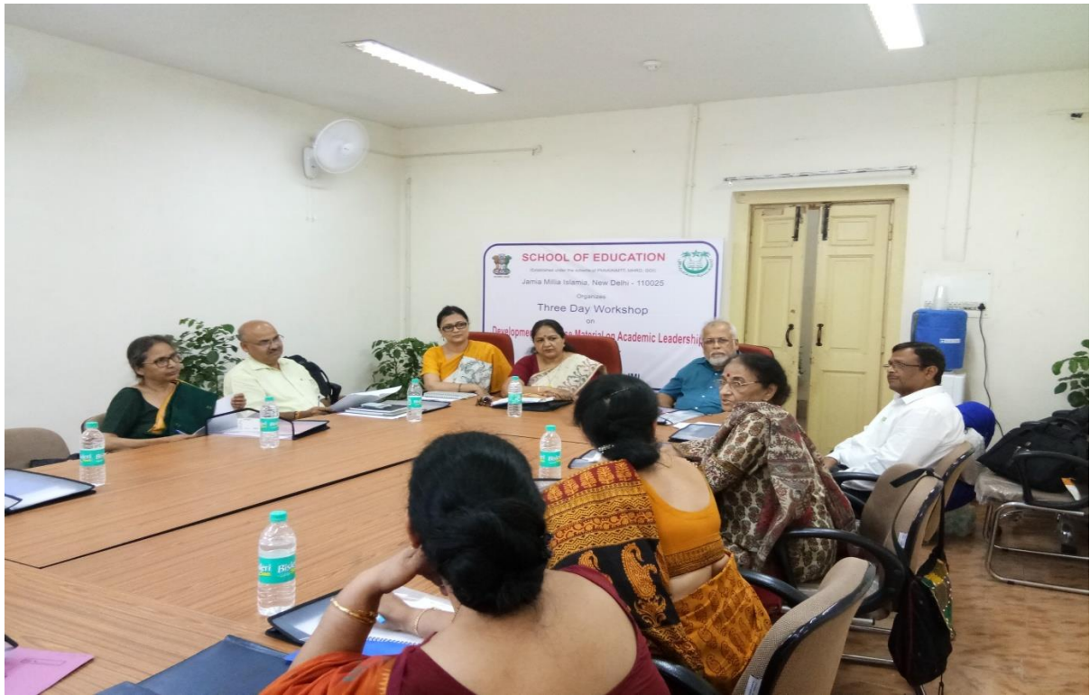
Experts discussing the details on online course on Academic Leadership on August 17, 2017