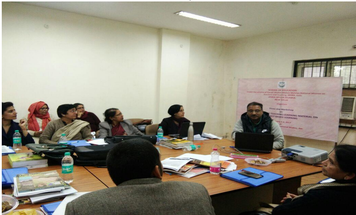
Participants from different subject areas discussing modalities of designing Project Based Learning for learners Feb 3, 2017