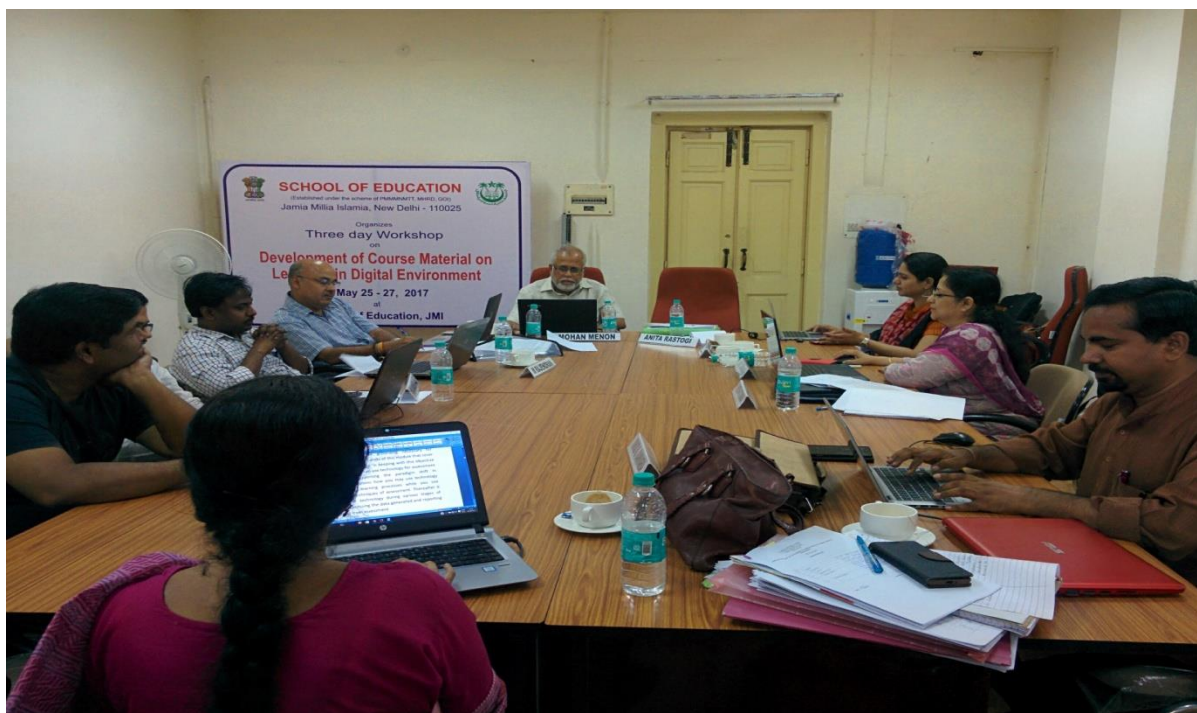
Experts working on modalities of course on Learning in a Digital Environment on May 27, 2017