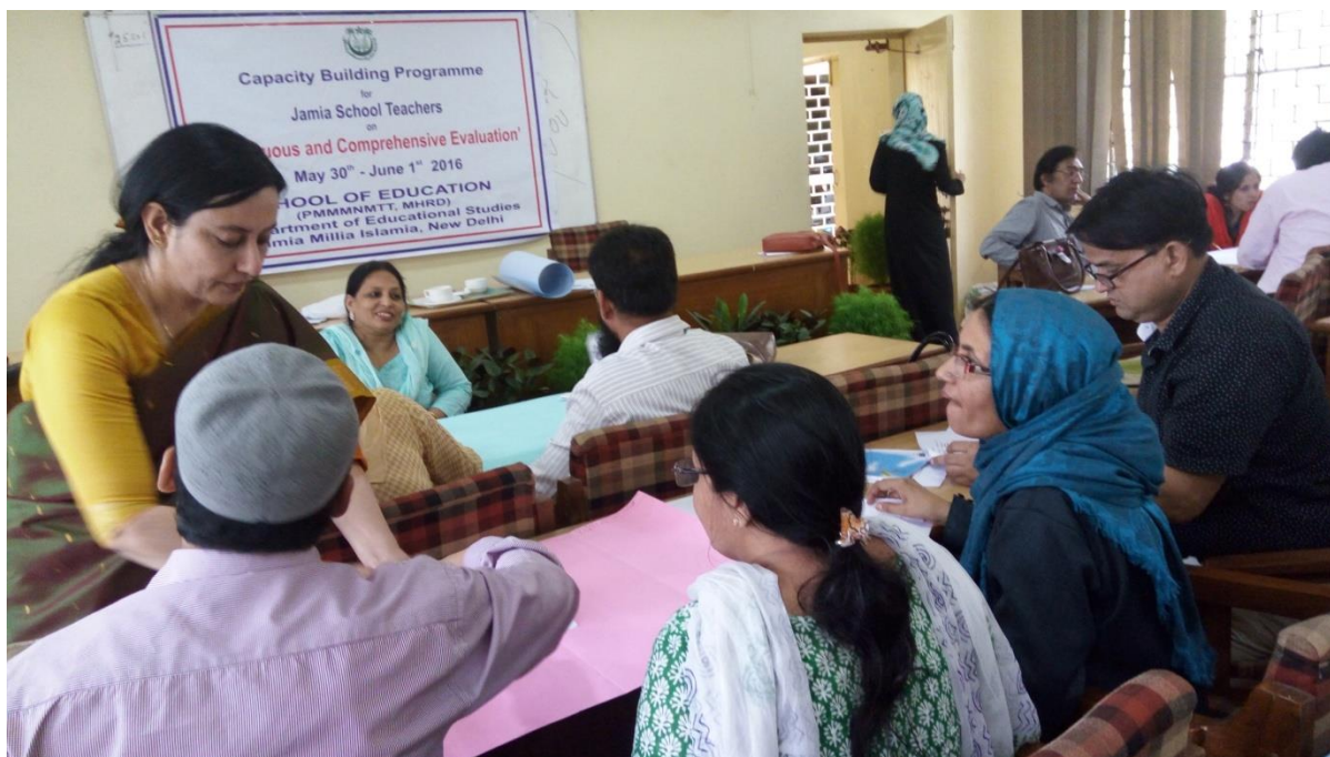
Workshop on training school teachers in CCE May 30, 2016