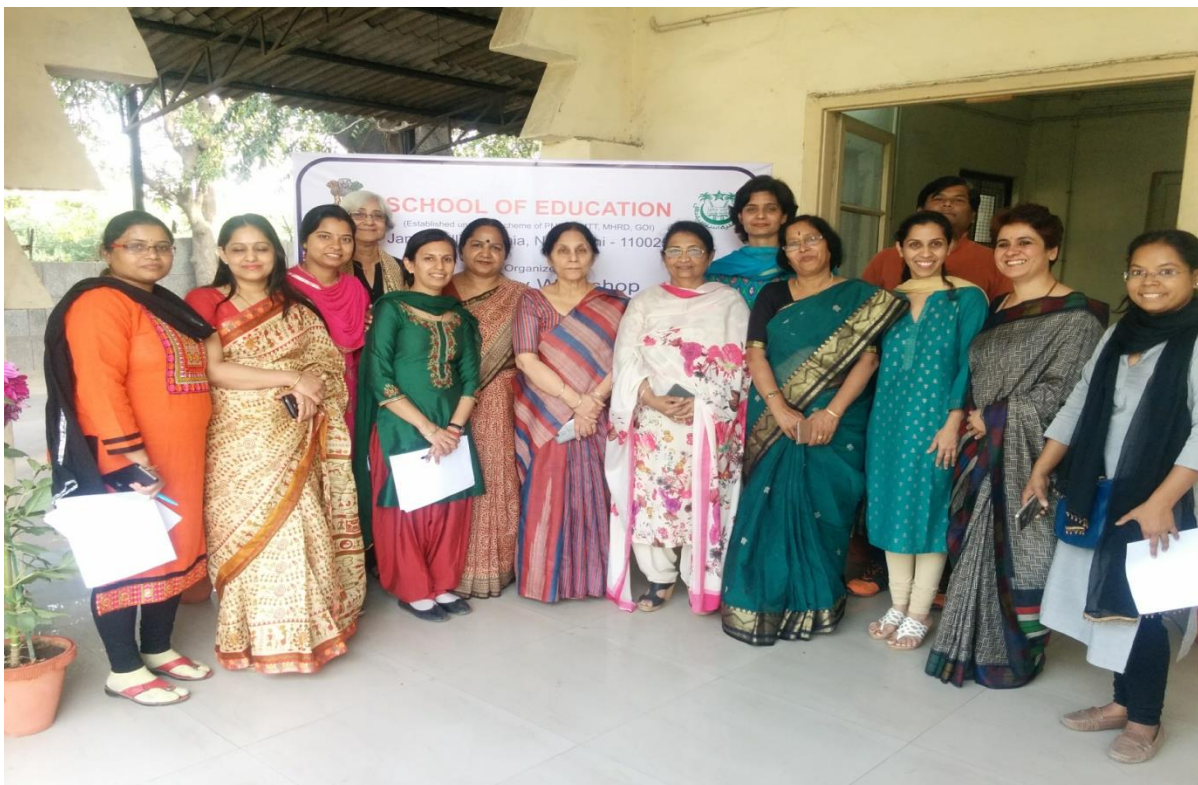
Participants of the workshop on Case Study as a pedagogical tool on March 18, 2017