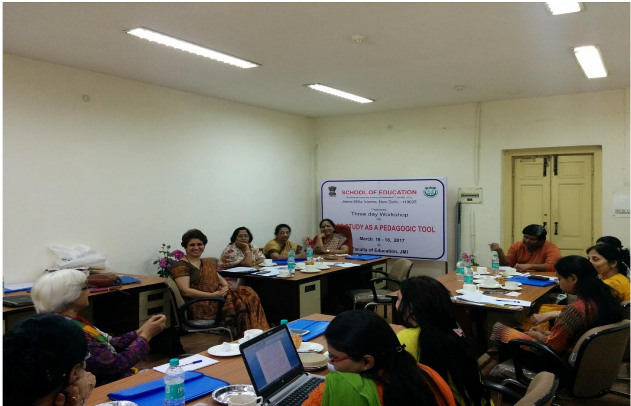
Participants sharing their anecdotes to be developed in cases during the workshop on Case Study as pedagogical tool on March 16, 2017