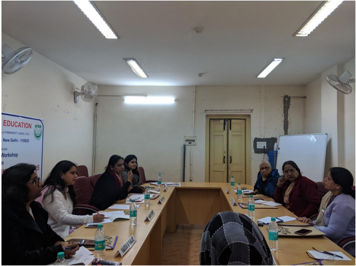
Experts discussing issues related to English teaching in schools on January 31, 2019