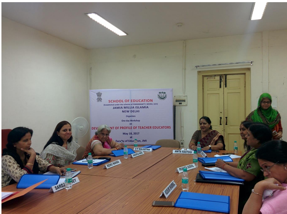
Experts discussing modalities of creating Profiles of Teachers organized on May 18, 2017