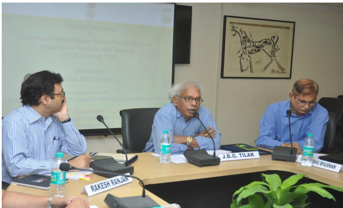
JBG Tilak, VC, NUEPA addressing participants of National Scheme of PMMMNMTT at Jamia Millia Islamia Oct 20, 2016