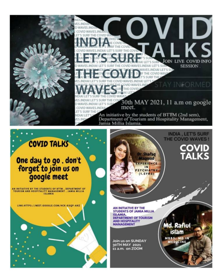
PUSIERS FUR AUVERTISEMENTS