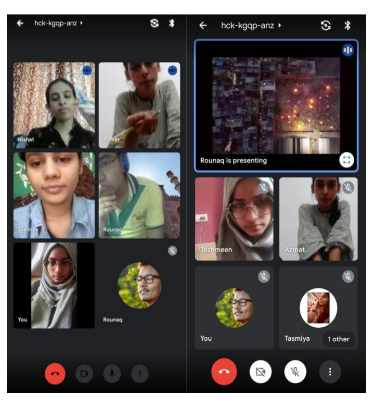
REHEARSALS OF THE EVENT