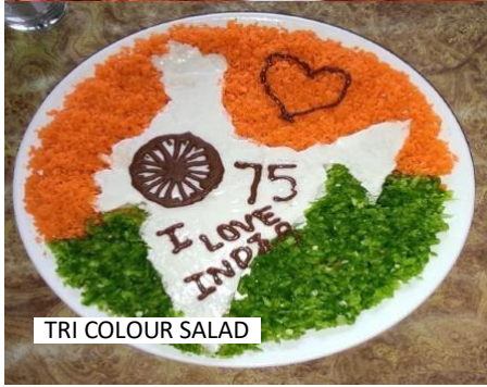
TRI COLOUR SALAD