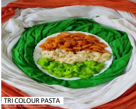
TRI COLOUR PASTA