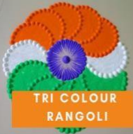
TRI COLOUR RANGOLI