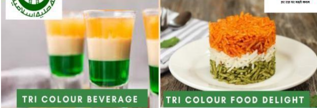
TRI COLOUR BEVERAGE