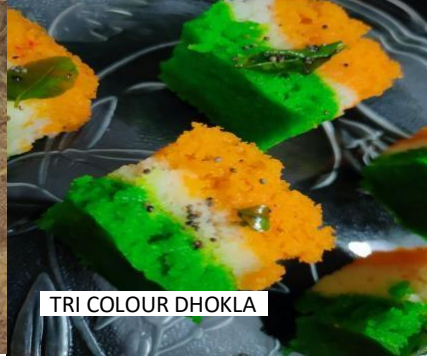
TRI COLOUR DHOKLA