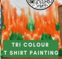
TRI COLOUR T SHIRT PAINTING