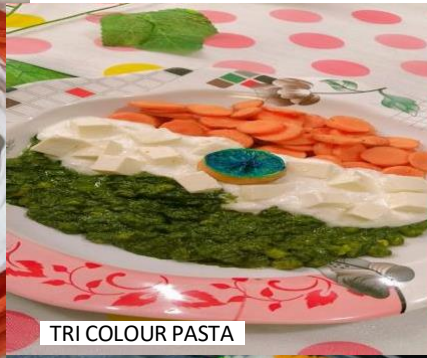
TRI COLOUR PASTA