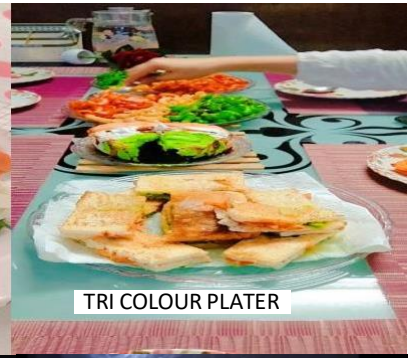
TRI COLOUR PLATER