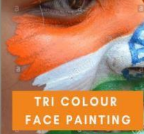
TRI COLOUR FACE PAINTING